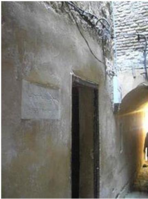
Maimonides' home in Fez.

You will also have time to walk through the maze of alleyways, which are too narrow for motorized vehicles, and with the up and down slopes, it is a walking tour that is best suited for hearty and healthy walkers.