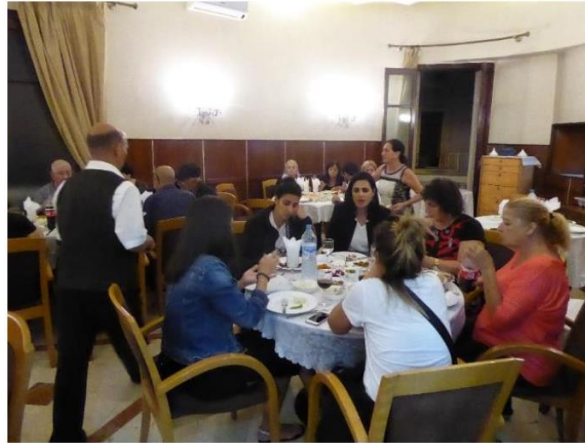
Casablanca's Jewish club, Cercle de L'union