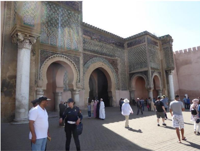
Entering an old palace in Meknes.

From Meknes, we drive a relatively short distance to Morocco's primary Roman archaeological site, Volubilis.