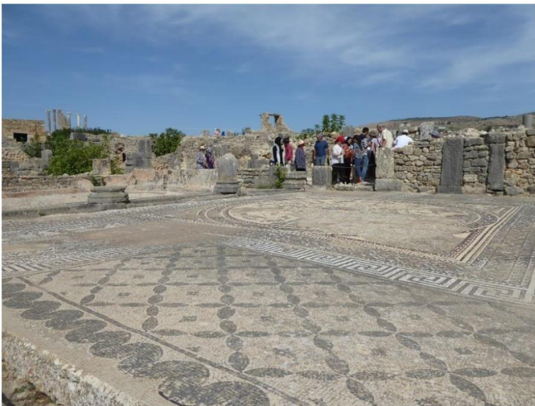
Volubilis, with Roman mosaics in situ.

From Meknes, we drive a relatively short distance to Morocco's primary Roman archaeological site, Volubilis.