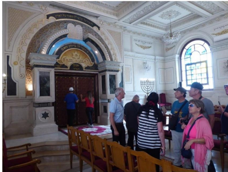
Visiting Beth El Synagogue.

Lunch today will be at the legendary, Rick's Café, which is modeled on Rick's Café portrayed in the Humphrey Bogart film, Casablanca.