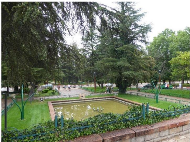
The town of Ifrane is unlike other Moroccan towns.

This morning, we depart Fez to Marrakech, traveling through the Middle Atlas Mountains, with a stop in Ifrane. A mountain town that looks more like a French ski resort than what one might expect to find in Morocco, Ifrane is, in fact, a popular ski resort in Morocco and one visited at times by the King, who keeps a home in the area. The scenic terrain traveling south towards Marrakech gradually transitions from mountains to more arid terrain.