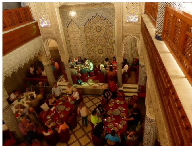
Plenty of enjoyable dining in Morocco.

Dinner tonight will be in a nice venue. Overnight in Fez. (B, L, D)