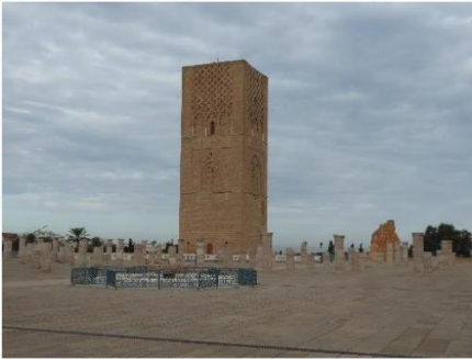
Hassan Tower in Rabat.

the intent was that it become the largest minaret in the world at that time. Due to his death within four years of the start, construction stopped and the tower that remains is approximately half the height that was originally intended. We also visit the neighboring mausoleum of Mohamed V.